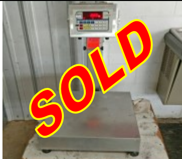
Cardinal Platform Scale Model 708-S, 1,000lb capacity $295.00