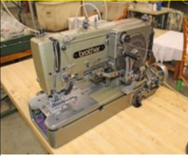
Brother Model LBH-B814 Lockstitch Button Hole Reduced $795.00