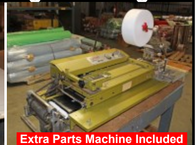
Summit Fusing Machine Model SR-200 Mini Press Reduced $495.00