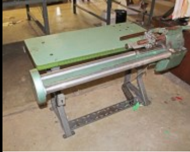
Utica Collarette Cutter For tubular Knits $795.00