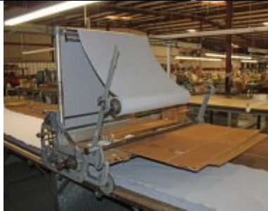
Utica Fabric Spreader For Tubular Knits $795.00