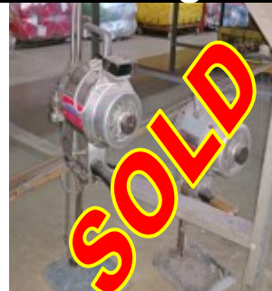
Panther & Brute Cutting Knives Selling As Is For Parts Both... $325.00