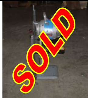
Intercut Model CN-800 8" Blade 110 Volt $350.00