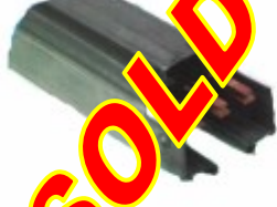
Federal Feedrail 60 Amps, 300 volt, 3 pole 10' rails, 220v & 110v