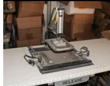
AC Pocket Creaser Model XL-75 Reduced $895.00