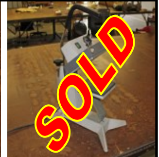
Insta Heat Press 4" x 4" Bed Size 110 volt $175.00