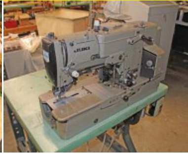
Juki Model LBH-782 Lockstitch Button Hole Reduced $795.00