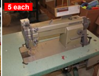
Singer Model 591 Single Needle Fully Automatic Reduced $150.00