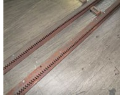
Utica Geared Track For Utica Spreader $5.00 per foot