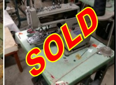
Juki MB-372 Single Needle Button Sew $395.00