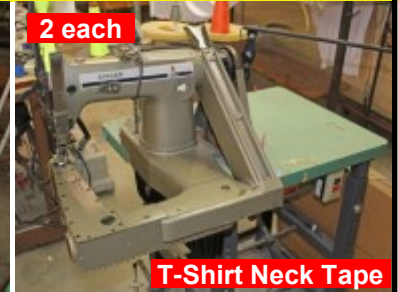
Yamato Model VC2700 2 Needle Cylinder Cover Stitch $995.00