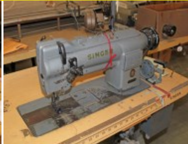
Singer Model 212 2 Needle Lock Stitch $195.00