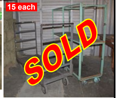
Metal Carts Rolling Metal Fabric Carts Reduced $85.00 ea