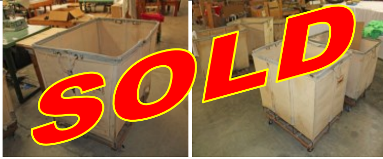
Lot of Dandux Hampers Sizes include 6, 10, & 12 Bushel 37 Total... Fair to Good Condition Buy All $1,500.00