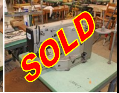
Juki Model LK-1852 28 Stitch Bar Tack $995.00 each