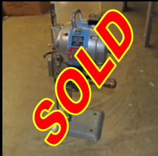
Eastman Bluestreak II Model 629 8" Blade 110 Volt $695.00