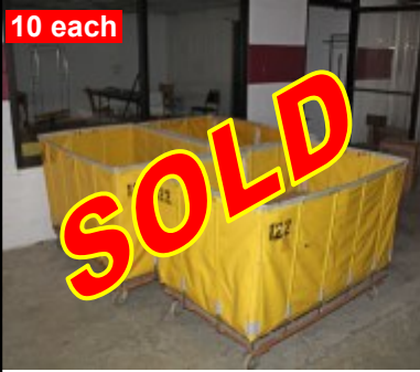
Dandux Hampers 24 Bushel, Vinyl $95.00 each