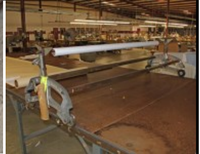
Manual Spreader Up to 66" Width $250.00