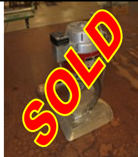
Eastman Cardinal Model 548 Circle Knife $450.00