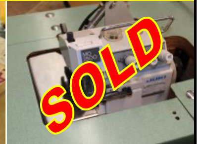
Juki Model MO-2504N 3 Thread Serger $850.00